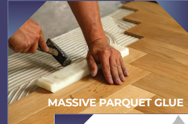
MASSIVE PARQUET GLUE