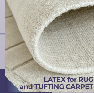
LATEX for RUG and TUFTING CARPET