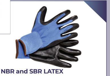
NBR and SBR LATEX