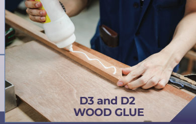
D3 and D2 WOOD GLUE